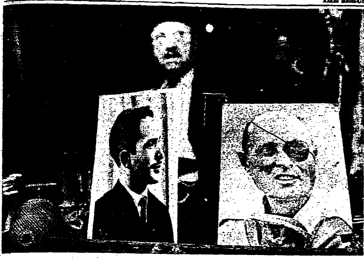
An East Jerusalem shopkeeper uses the political angle to drum up business — Jordan's King Hussein and Mr. Dayan find themselves surrounded by antiques.